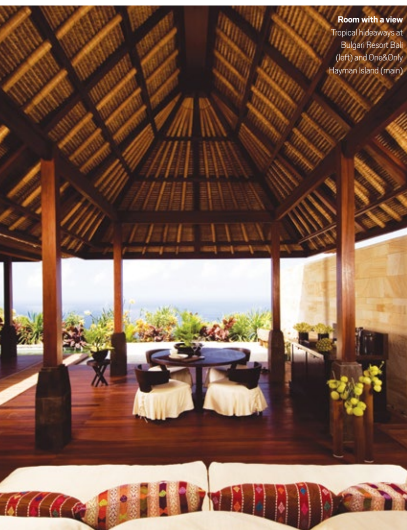
Room with a view Tropical hideaways at Bulgari Resort Bali (left) and One&Only Hayman Island (main)