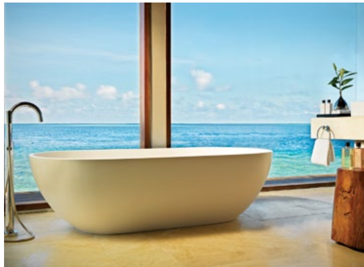
Ocean bliss Bathroom tranquility at Jumeirah Dhevanafushi (above), and beachside dining at The Oberoi, Mauritius

Afloat in the Indian Ocean, some 2,000 kilometres east of Africa, Mauritius is a collage of dramatic scenery with a fusion of Asian, African and French cultures. Delve into that at The Oberoi, Mauritius (+91 11 2389 0606; www.oberoihotels.com ), which spreads across eight hectares on the isle's north-western coast. It only feels right to check into a low-lying Royal Villa, with its 650 square metres of private space, which boasts a personal pool and a gazebo for secluded dining. Expect to find frangipani blossoms everywhere — in your sunken bathtub, atop your pillows, even in heart-shaped designs on the floor. Spend afternoons swimming in Turtle Bay, or taking advantage of The Oberoi's 'Touching Senses' complimentary programs, which range from cooking classes to guided hikes.