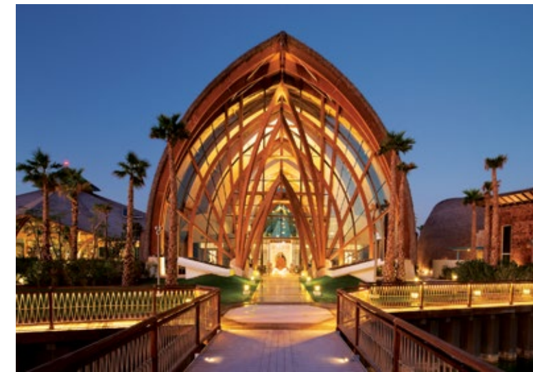
The Life Aquatic The main sunrise pool at Viceroy Anguilla and the striking entrance to Anantara's Banana Island Resort, Doha

“Besides sand and sea, it's just you two and the elements here on this far-flung bit of beach, a boat ride away from the resort”