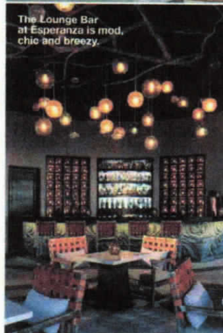
The Lounge Bar at Esperanza is mod, chic and breezy.