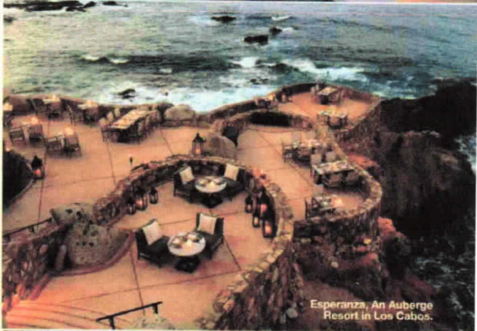
Esperanza, An Auberge Resort in Los Cabos.

“Oh Mexico/It sounds so simple I just got to go/The sun’s so hot I forgot to go home.” From Elvis Presley and Pasty Cline to James Taylor, Jimmy Buffet, Toby Keith and Kenney Chesney, artists have been singing the praises of Mexico for generations. And with good reason—our neighbor to the south is sun-kissed and lined with beautiful beaches, the cuisine is as inventive as it is singular, as are the cultural attractions. But, perhaps best of all, Mexico is a fantastic destination for a fun-fueled fiesta. Its varied attractions from sparkling cosmopolitan cities to laze-for-days sunny beaches pair perfectly with every variety of nuptial celebration from engagement to honeymoon. Here’s where to raise a glass south of the border.