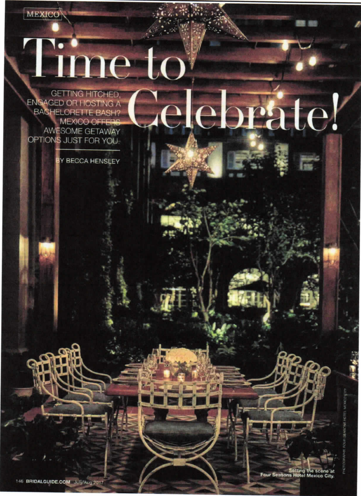
PHOTOGRAPHY: FOUR SEASONS HOTEL, MEXICO CITY