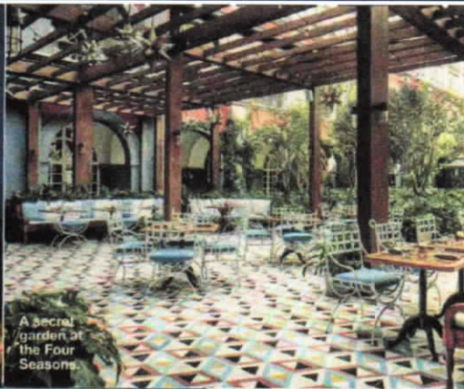
A secret garden at the Four Seasons.