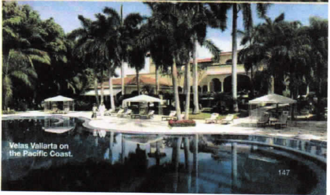
Velas Vallarta on the Pacific Coast.

Get betrothed in the capital city that exudes old-school romance. Once home to the international artist couple Frida Kahlo and Diego Rivera, North America’s oldest city flanks two impetuous volcanoes, brims with seductive architecture and serves up indigenous cuisine and modern cocktails. With more than 150 museums (including Casa Luis Barragán and Frida Kahlo’s Blue →