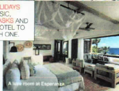
A luxe room at Esperanza.

Life's a party—especially when you add a shot or two of tequila and a sizzling beach scene. Rather than planning completely separate bachelor and bachelorette destination fiestas, why not couple them up? If you'd like to divide your fêtes for some events or keep the stags and hens on their own, consider sister properties Casa Velas and Velas Vallarta , located just five minutes from each other. You can coordinate to book the stellar Bachelor and Bachelorette package at the all-inclusive properties for up to 16 guests. At boutique Casa Velas, there's a novel "handbag bar," where purses can be borrowed for the evening. Guys will enjoy the laid-back Velas Vallarta that buzzes with activities including flyboarding and skydiving. VIP nightclub service, a beachfront barbecue, tequila and taco tastings, golf, yoga and spa services ensure this extravaganza is legendary. Stay in the presidential suite at Casa Velas and enjoy four bedrooms and an 11,000-square-foot pool (package rates start at $50,000 for 16 guests and couple and are all inclusive; velasvallarta.com).