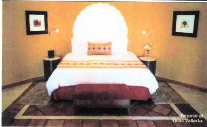
Repose at Velas Vallarta.