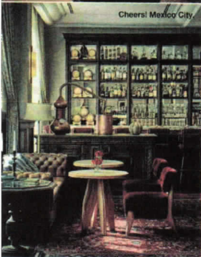
Cheers! Mexico City.

LAS FIESTAS OF MEXICO—THE HOLIDAYS CELEBRATED HERE—INCLUDE MUSIC, MERRIMENT AND, OFTENTIMES MASKS AND COSTUMES. CHECK WITH YOUR HOTEL TO SEE IF YOUR VISIT COINCIDES WITH ONE.