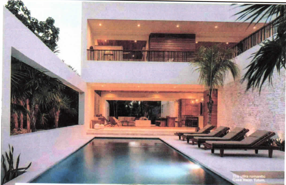
The ultra romantic Casa Xim Tulum.

“Oh Mexico/It sounds so simple I just got to go/The sun’s so hot I forgot to go home.” From Elvis Presley and Pasty Cline to James Taylor, Jimmy Buffet, Toby Keith and Kenney Chesney, artists have been singing the praises of Mexico for generations. And with good reason—our neighbor to the south is sun-kissed and lined with beautiful beaches, the cuisine is as inventive as it is singular, as are the cultural attractions. But, perhaps best of all, Mexico is a fantastic destination for a fun-fueled fiesta. Its varied attractions from sparkling cosmopolitan cities to laze-for-days sunny beaches pair perfectly with every variety of nuptial celebration from engagement to honeymoon. Here’s where to raise a glass south of the border.